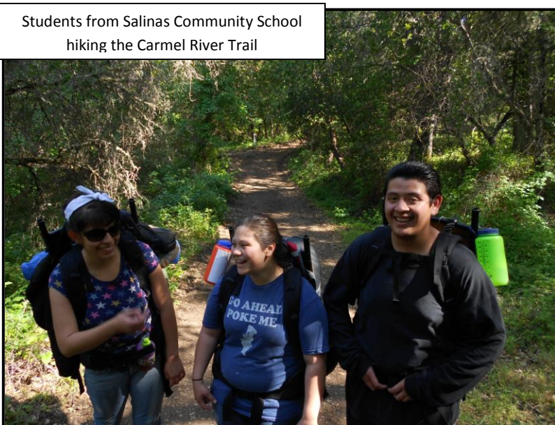
Students from Salinas Community School hiking the Carmel River Trail

The Ventana Wilderness Alliance's Youth in Wilderness Program is celebrating the end of a successful 2010-2011 field season, and is looking forward to an ever expanding group of partners and increased wilderness opportunities for youth across the central coast.