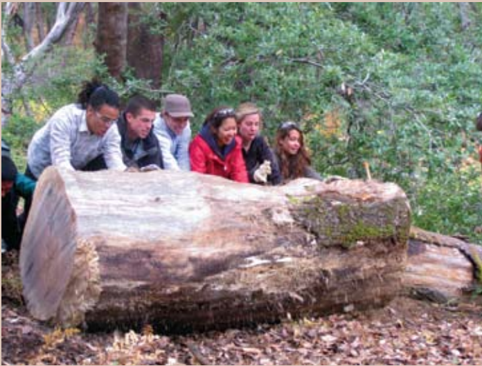
UCSC students get rolling at Apple Tree Camp.

program's success in connecting with and serving young people throughout the Monterey Bay area and beyond.