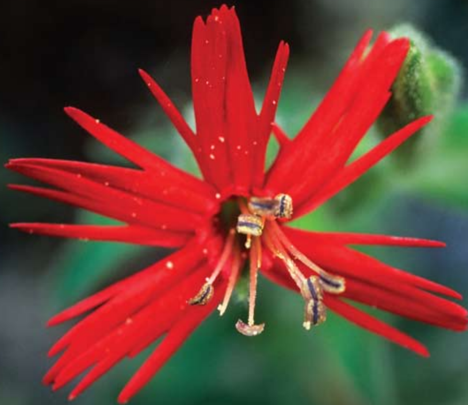
Indian Pink ( Silene californica )