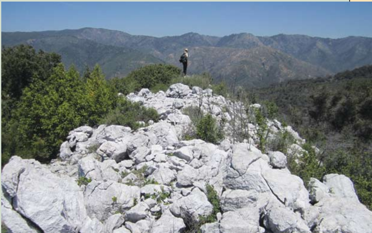
A VWA staff member inventories an old hand line north of Post Summit.

the northern Santa Lucia Range precludes a “one size fits all” approach to fire management, and anyone who has ever hiked in the backcountry knows the limitations of maps as a planning tool. To address this knowledge gap, VWA staff have been manually documenting fire breaks and hand lines within and adjacent to the Ventana Wilderness. The end result will be a georeferenced photodocumentary (in publicly-available Google Earth format)