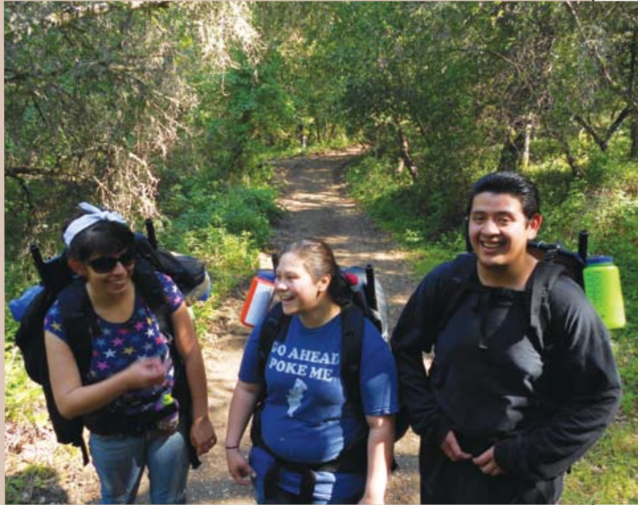
Salinas Community School students enjoying the walk.

This year we expanded our existing relationships with Salinas Community School, CSU Monterey Bay and UC Santa Cruz. These included environmental education trips into the Carmel River and Tassajara Creek watersheds, as well as trailwork restoration trips on the Skinner Ridge, Pine Ridge and Ventana trails. We also fostered new partnerships with Rancho Cielo Alternative High School, Big Sur Land Trust, King City Elementary Science Camp and Cal Poly San Luis Obispo. These new partnerships involved work on the Marble Peak trail, restoration of the Cruikshank trail and environmental education on the Mitteldorf Preserve. In addition, we led interpretive hikes and multi-day backpacking trips for high school students from across the state, underscoring the importance of getting all Californians excited about their public lands. The breadth of ages, as well as diverse cultural and geographic backgrounds within Youth in Wilderness outings demonstrate the